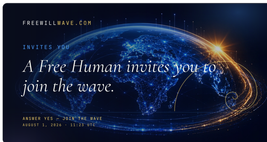
A personal invitation, shared by a Free Human.

Members and non-members may voluntarily help cover the cost of email, hosting and infrastructure. Support carries no rank, no advantage, no special number, no place in the Fibonacci relay and no additional authority. Money supports the existence of the experiment; it never determines a person's importance inside it.